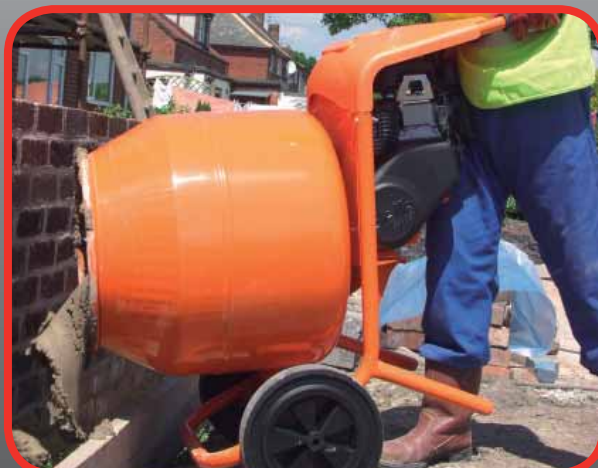
Balanced Design Ensures Control When Tipping