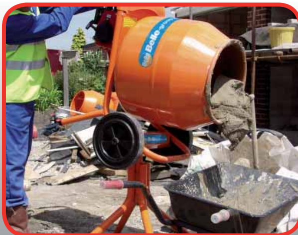
Barrow Height Tipping