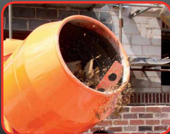
Rapid Mix Drum Paddles